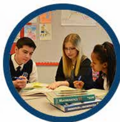
Secondary School Grades 9 to 12