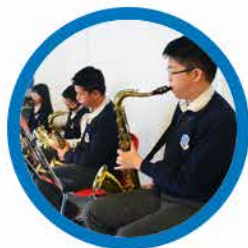
Elementary School Grades 1 to 8