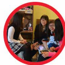
Boarding Program Grades 7 to 12