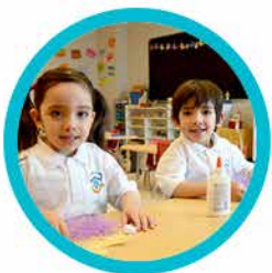
JASX Early Learning Ages 3.8 to 6 years of age