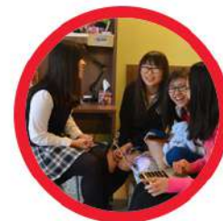
Boarding Program Grades 7 to 12