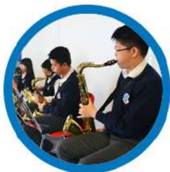
Elementary School Grades 3 to 8