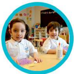
Montessori Programs Ages 3 to Grade 2

it all comes together in the fifth... that's the Addison Advantage™