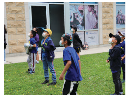
Egg Throwing Activity