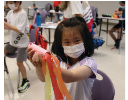
Dragon Crafting Activity