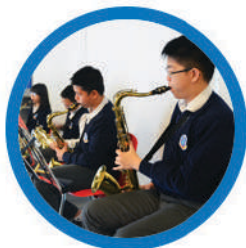
Elementary School Grades 1 to 8