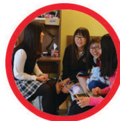
Boarding Program Grades 7 to 12