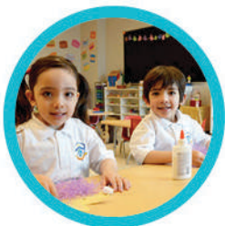
JASX Early Learning Ages 3.8 to 6 years of age

it all comes together in the fifth... that's the Addison Advantage™