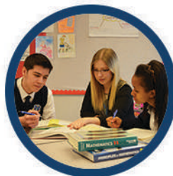
Secondary School Grades 9 to 12