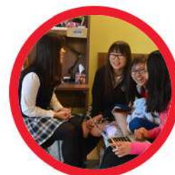
Boarding Program Grades 7 to 12