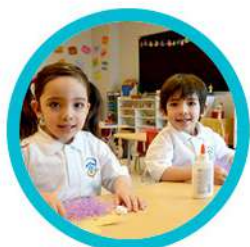
JASX Early Learning Ages 3.8 to 6 years of age

it all comes together in the fifth... that's the Addison Advantage™