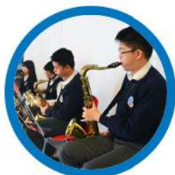
Elementary School Grades 1 to 8