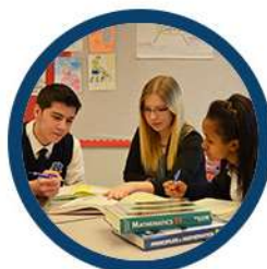
Secondary School Grades 9 to 12