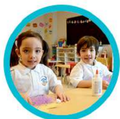
Montessori Programs Ages 3 to Grade 2

it all comes together in the fifth... that's the Addison Advantage™