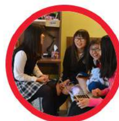
Boarding Program Grades 7 to 12