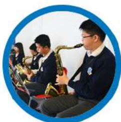
Elementary School Grades 3 to 8