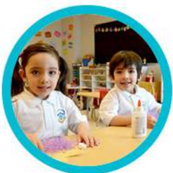
JASX Early Learning Ages 3.8 to 6 years of age

it all comes together in the fifth... that's the Addison Advantage™