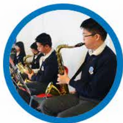
Elementary School Grades 1 to 8