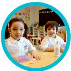
JASX Early Learning Ages 3.8 to 6 years of age

it all comes together in the fifth... that's the Addison Advantage™