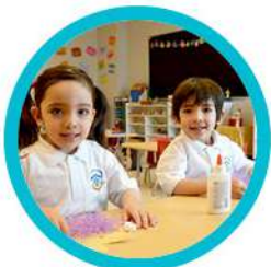
JASX Early Learning Ages 3.8 to 6 years of age

it all comes together in the fifth... that's the Addison Advantage™