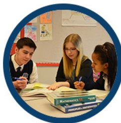
Secondary School Grades 9 to 12