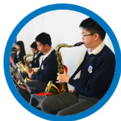
Elementary School Grades 1 to 8