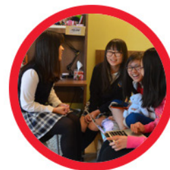
Boarding Program Grades 7 to 12