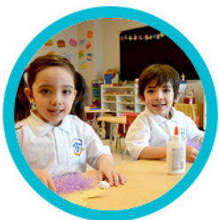
JASX Early Learning Ages 3.8 to 6 years of age

it all comes together in the fifth... that's the Addison Advantage™