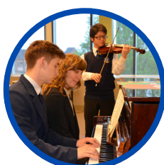
Elementary School Grades 1 to 8