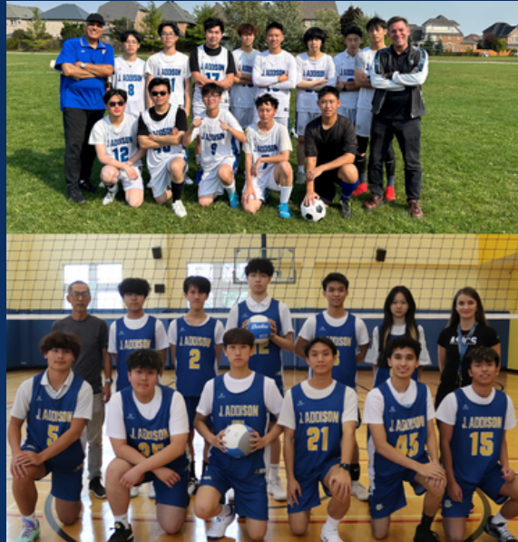
Boys Soccer and Volleyball teams

As we emphasize, sports in high school are an integral part of student development at J Addison, preparing them for future life challenges.