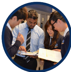
Secondary School Grades 9 to 12