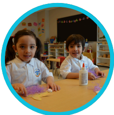
Early Learning Ages 3.8 to 6 years of age

It all comes together in the fifth... that's the Addison Advantage™