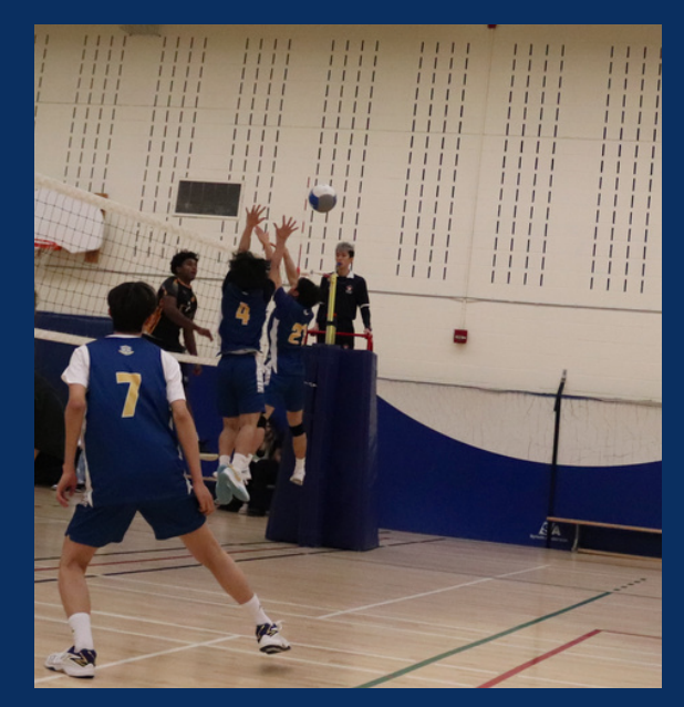
Boys Volleyball Last Game

In October, the J. Addison School boys' volleyball team played their final game of the season, showcasing impressive teamwork and determination. The match was an exciting culmination of weeks of hard work and practice, with the players giving their all on the court. Despite facing tough competition, the team's sportsmanship and skill were on full display, as they communicated effectively and executed strategic plays. The crowd cheered enthusiastically, supporting the players through every set. Although the outcome didn't go in their favor, the boys demonstrated tremendous growth throughout the season, and the game marked a memorable end to a successful campaign. It was a proud moment for both the players and coaches, reflecting the dedication and effort that went into their development as athletes.