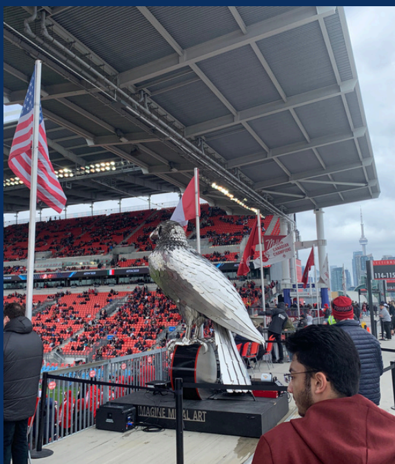
Toronto FC VS Minnesota United FC

Moreover, I can attest that without objectives, there were a lot of good plays, wonderful defense, and some excellent footwork by both teams. Emphatically, I can state that the outing experience with my dorm friends made us closer and gave us something awesome to talk about afterwards. All things considered, it was an adventure that I would never forget. It was so much fun and I am already anticipating the next event!