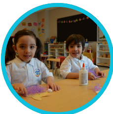
Early Learning Ages 3.8 to 6 years of age

It all comes together in the fifth... that's the Addison Advantage™