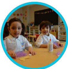
Early Learning Ages 3.8 to 6 years of age

It all comes together in the fifth... that's the Addison Advantage™